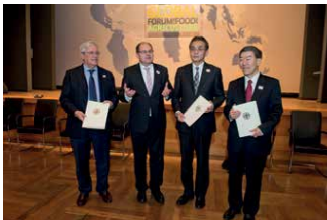
Joan Clos, Christian Schmidt, Hiromichi Matsushima and Niu Dun as Christian Schmidt hands over the final communiqué

The Berlin Agriculture Ministers' Conference (closed to the public) will again take place in the Weltsaal of the Federal Foreign Office in 2017. It will bring together politicians from all over the world to discuss the subject of “ Agriculture and Water – Key to Feeding the World ”. A final communiqué of the conference will formulate the Agriculture Ministers' joint position and will feed into the international agricultural debate.