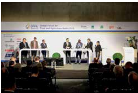
International Business Panel Discussion hosted by the GFFA Berlin e.V.

For further information please visit: www.gffa-berlin.com