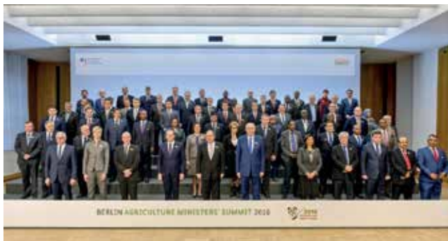
The participants of the Berlin Agriculture Ministers' Conference 2016

The many events carried out under the GFFA 2017 are intended to provide impetus for future developments in the area of “Agriculture and Water” on the international level.